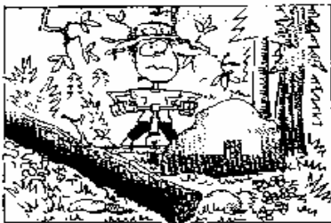
RIDE ON OPEN TRAILS ONLY!