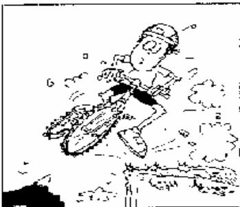
CONTROL YOUR BICYCLE!